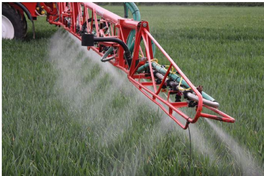
Low drift nozzles

A key delivery mechanism for VI water activities remains its strategic partnership with Natural England's Catchment Sensitive Farming (CSF). More detail on this activity is provided on p9. River monitoring by the EA for seven full crop years shows that the VI together with CSF is delivering a 50% reduction in the overall pesticide levels in six test catchments in spite of significant challenges from the increased area of oilseed rape and associated herbicide use in the test catchments.